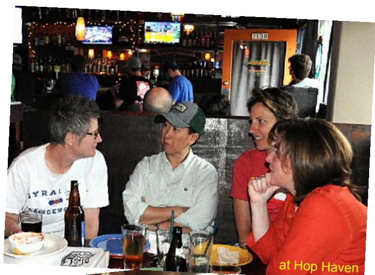
at Hop Haven