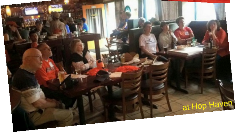
at Hop Haven