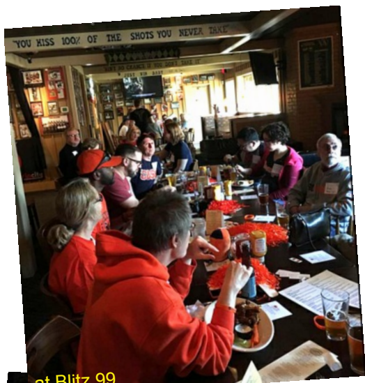
at Blitz 99

Then basketball reigned supreme for the next four days. We gathered Saturday evening at Blitz 99 for the men's semifinal against North Carolina. It didn't exactly turn out the way we wanted, but still we had fun. The venue shifted to Hop Haven for Sunday's women's semifinal. The women vanquished Washington that night, to advance to the final Tuesday against UConn. We were back at Hop Haven, where the outcome wasn't what we'd hoped for, but what a run the women had!