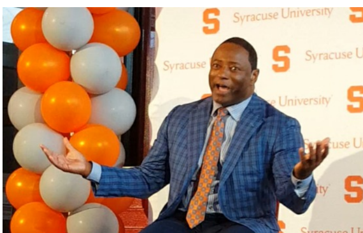
On Clemson at homecoming: “I'm into new things!”

Stay tuned: that Sep. 14 game just happens to be the Stumptown Orange's first gamewatch of the season and our annual blood drive. No pressure, coach!